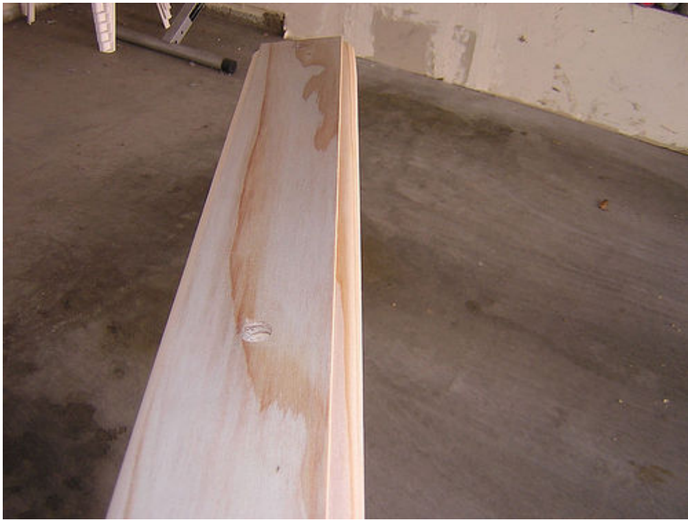
Also started shellacing them.